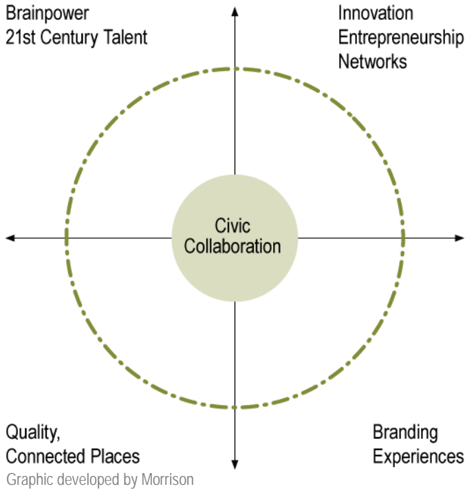
Figure 14: Regional Prosperity Depends on a Portfolio of Investments in Five Key Areas

The real challenge facing every region is to allocate investment across these five strategic focus areas in an optimal way. Optimal means the mix that best exploits a region’s competitive advantages at the lowest possible risk. Achieving this outcome is tricky and represents a complex set of decisions. It requires that the region have the necessary prerequisites before it can even begin to invest: a Regional Partnership (the Who); a set of Strategic Outcomes (the What); and a Strategic Process (the How), as described in Chapter 2.